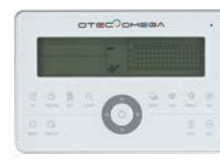
Centralized Controller VAEEC-D064T (Optional)