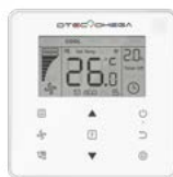
Wired Controller VAECR-D001 (Standard)