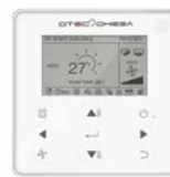
Deluxe Wired Controller VAECD-D001 (Optional)