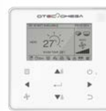
Deluxe Wired Controller VAECD-D001 (Optional)