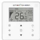
Wired Controller VAECR-D001 (Standard)