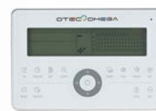
Centralized Controller VAEEC-D064T (Optional)